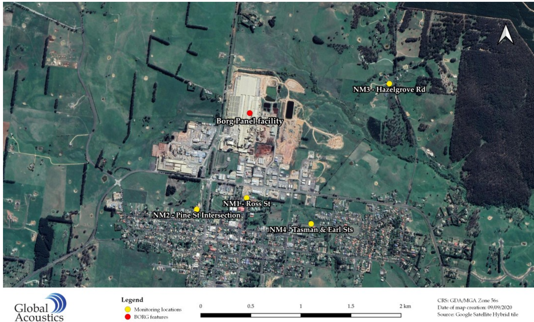
Figure 1: Attended Noise Monitoring Locations